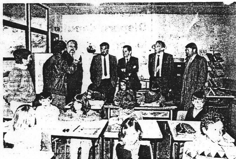
La commission se fait expliquer le programme pédagogique des CP.