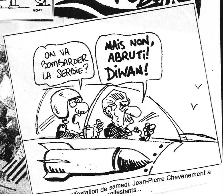
Photos/cartoons from Bretagne/Info (122, 123, 136 (26 mars, 2 avril, 2 juillet)